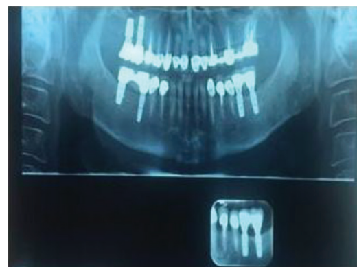
Fig 4. Case two, panoramic radiography, three and a half years after implant loading.