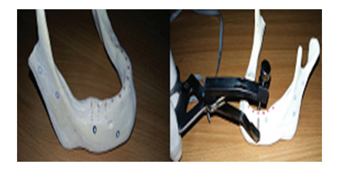
Fig 1. Edentulous mandibular model used for testing of the efficacy of newly designed bone gauge.

To assess the efficacy of the instrument, an edentulous mandibular model and a digital caliper with 0.1 mm accuracy were used. The results of measurements made at 1, 2, 3 and 4 mm apical to the bone crest are presented in Table 1.