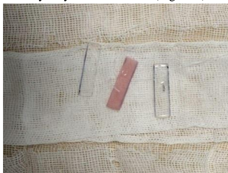
Figure 1- Prepared acrylic resin blocks

In this study, ten specimens fabricated from each of heat cured acrylic resins: Meliodent (Heraeus Kulzer, Hanau, Germany), Vertex (Vertex-dental BV, Zeist, Netherlands), Mead way (Dental Supplies LTD, Surrey, England) and Versacryl (Keystone, Gibbstown, NJ). A special metal mold (25mm×7mm in thickness of 2 mm) was fabricated for forming the wax blocks. The wax patterns for conventional water bath polymerization were invested in the brass flask and were allowed to set. After the dew axing process, acrylic resins were mixed and polymerized according to the manufacturer's instructions. Specimens which showed porosity discarded and replaced with new ones. It made a total of 40 study acrylic resin blocks. (Figure 1).