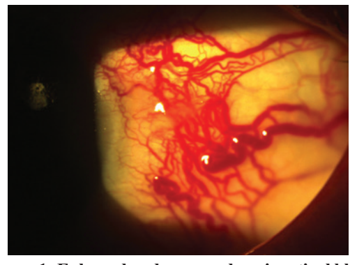
Figure 1: Enlarged and engorged conjunctival blood vessels without feeding vessels.

The ethics committee of Baqiyatallah University of Medical Sciences approved the present report and written consent was given by the patient. A 63-year-old woman was initially presented with painful visual acuity loss of the left eye since 3 weeks ago. The visual acuity was 0.6 in the right eye and no light perception in the left eye. A moderate nuclear sclerosis was detected in the right eye and fundus examination was unremarkable. The left eye had conjunctival injection and engorged episcleral vessels with mild corneal edema (Figure 1).