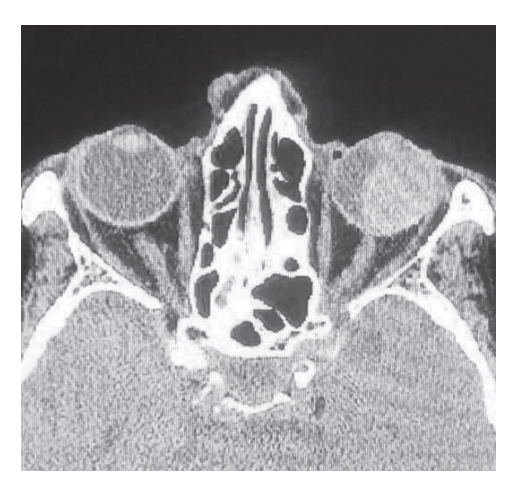
Figure 3: Axial CT scan image showed a homogenous intraorbital mass from lens to optic nerve head without proptosis. There was not any erosion of the orbital wall and extension.