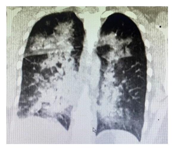
Figure 2. Anteroposterior (AP) view of Chest computed tomography scan

Mother went through respiratory support with reservoir bag oxygen face mask. Treatment with corticosteroid (8 mg dexamethasone twice a day) and 200 mg hydroxychloroquine twice a day was initiated. After four days, her spontaneous respiration was normal and she was discharged with outpatient medication. Moreover, patient was educated regarding self-isolation. Neonate was discharged after 72 hours with acceptable condition.