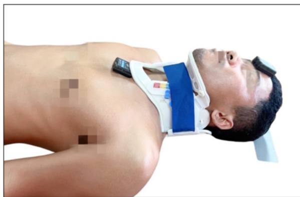
Figure 1: Position for installing inertial measurement unit (IMU) on the forehead and the chest.

participant to the ambulance emergency bed.