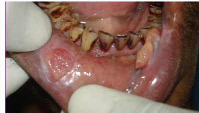
Figure 4. Traumatic Fibromas on Lower Labial Mucosa.

A 32 year old patient in her third trimester presented with a tender, soft pedunculated lesion in relation to 41 and 42 with profuse bleeding on probing. Excisional biopsy was done under local anesthesia with 0.8 W power setting. Histopathological diagnosis was pyogenic granuloma. No sutures or postoperative medication was required. Optimum healing with minimal pain and discomfort was noted (Figures 10-12).