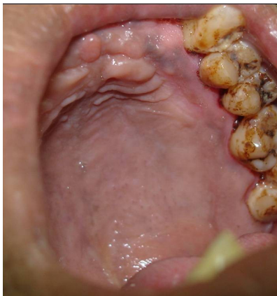
Figure 3. Desirable Wound Healing With no Scar Tissue Formation.