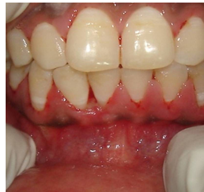
Figure 12. Complete Wound Healing Without Scar Formation.