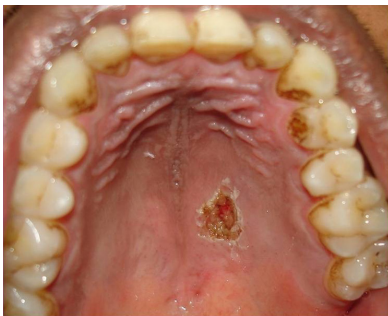
Figure 8. Immediate Postoperative With no Bleeding.