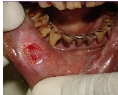
Figure 5. Immediate Postoperative With no Bleeding.