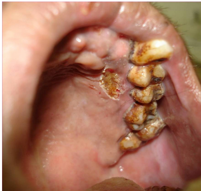
Figure 2. Immediate Postoperative With no Bleeding.