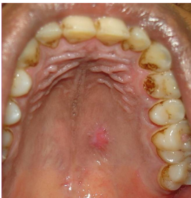
Figure 9. Two Weeks Postoperative Demonstrating Adequate Healing.