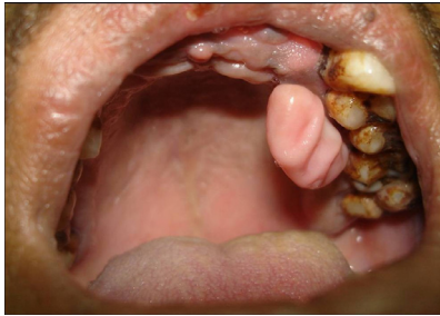
Figure 1. Chronic Irritational Fibroma on Palate.

A male patient aged 55 years reported with 2 nontender, pedunculated, firm and smooth tumors on lower labial mucosa with underlying oral submucous fibrosis. Excisional biopsy was done under local anesthesia with 2 W power settings in contact mode. Histopathological diagnosis was inflammatory fibrous hyperplasia (Figures 4-6).