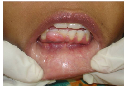
Figure 10. Pyogenic Granuloma in Relation to 41, 42.

This paper presents our elemental clinical experience from the use of diode laser for the purpose of excisional biopsies. The benefits of laser surgery include hemostasis and outstanding field visibility, precision, superior injection control and exclusion of bacteremia, reduced mechanical tissue trauma, minimal postoperative pain and edema, negligible scarring and tissue shrinkage, microsurgical capabilities, and fewer instruments at the site of operation. 4,5 The hemostatic nature of the laser is of immense value in excising exophytic lesion. It can be used to arrest bleeding in the field by its ability to contract vascular wall collagen. 6 This allows extremely good visibility and precision when