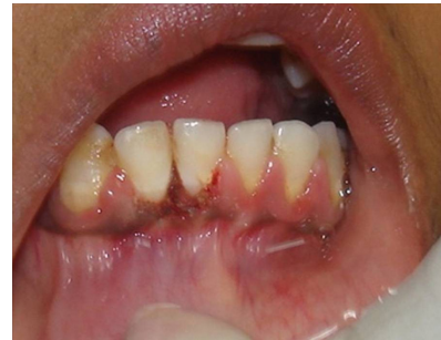
Figure 11. Immediate Postoperative With Minimal Bleeding.