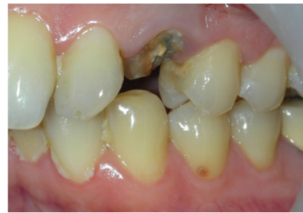
Figure 1. Preoperative Intraoral View.

The affected teeth were extracted atraumatically (Figure 1) using minimally invasive techniques with periostomes (GDC, India) and luxators (SDI, Sweden). The extractions were performed without raising flaps. Inflammatory tissues, pus, and necrotic tissues were removed by thorough socket curettage. Care was taken to clean both the