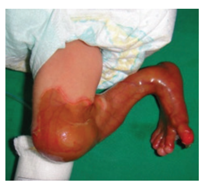
Fig 3. Absent Skin on Knee Joint, Leg and Foot