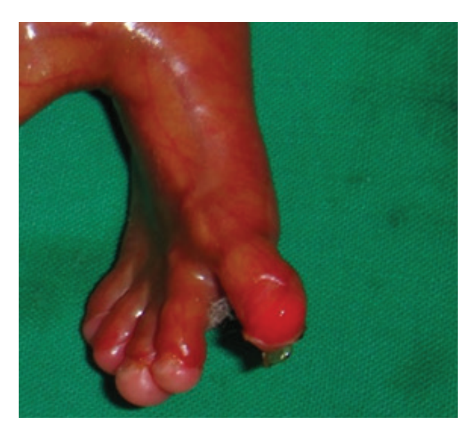
Fig 2. Absent Skin on Foot and Toes