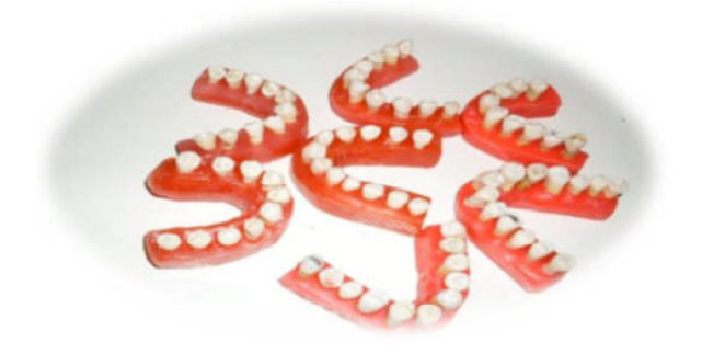
Figure 1. Teeth were mounted in rose wax casts in dental arch form

relationship between the crown size and the prevalence of two root canals in mandibular incisors by Peck & Peck index of orthodontics. This index describes the numerical expression of the crown shape and is the result of dividing maximum mesiodistal (MD) diameter by maximum faciolingual (FL) diameter multiplied by 100. Using caliper, they calculated Peck & Peck index for teeth determined as two-canal incisors in radiography, and evaluated the relationship between the teeth with two canals and the index [6].