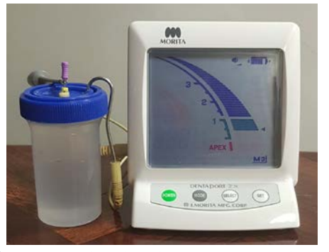
Figure 1. Working length measurement with EALs

Nowadays, there are many devices that use radio frequency with different wave lengths and these are commonly used in most urban environments from offices to homes. Most investigations regarding impact of electronic devices on the accuracy of working length measurements of electronic apex locators used cell phones or cordless phones for this purpose [14-16]. The aim of the present investigation was to determine the effect of asymmetric digital subscriber line (ADSL), MP4 player, cordless telephone, mobile phone and frequency modulation (FM) radio wave on an apex locator.