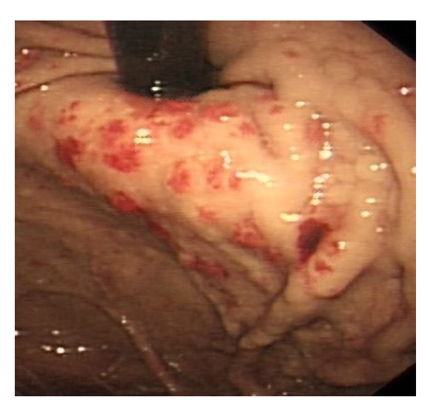
Figure 2. Endoscopy feature of patient B

Argon Plasma Coagulation is the safe and accepted first line of treatment in some gastrointestinal vascular disorders like the ones found in Patient B. However this treatment was not only unhelpful in Patient A, but it increased the intensity of bleeding (figure 2).