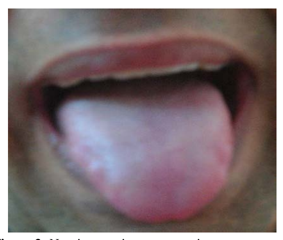
Figure 3. No pigmentation was seen in mucocutaneous area

PJS is a rare familial disorder, with an incidence of 1 in 12-30,000 live births (4) and occurs with an estimated frequency of 1/8300 to 1/280,000 individuals (5) and has a male to female ratio of 1:1. The average age at the time of diagnosis is 23 years in men, and 26 years in women (6). PJS presents with characteristic flat, pigmented, freckle-like cutaneous lesions mainly on the lower lip, perioral area, buccal mucosa, periorbital area and eyelids (4). These lesions are benign and not thought to have malignant potential (5). Our patient did not have any pigmentation in mucocutaneous area (figure 3).